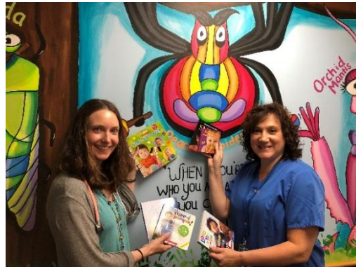
Children's Hospital of Philadelphia Neonatal Follow-up Program at Holy Redeemer Hospital