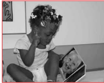
This 9 month old received her book from her pediatrician. The developmental milestones of early literacy for children ages 6-12 months include: reaches for book, puts book to mouth, turns pages with adult help, looks at pictures, vocalizes, pats picture, prefers pictures of faces.